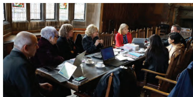
Education teams from the UK and China meet at Harrow UK to build our unique bilingual curriculum