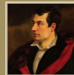
George Gordon Byron